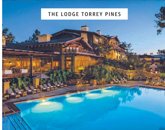
THE LODGE TORREY PINES